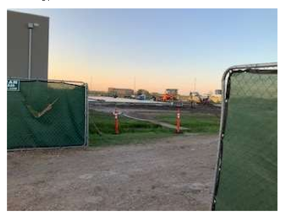
Walls going up