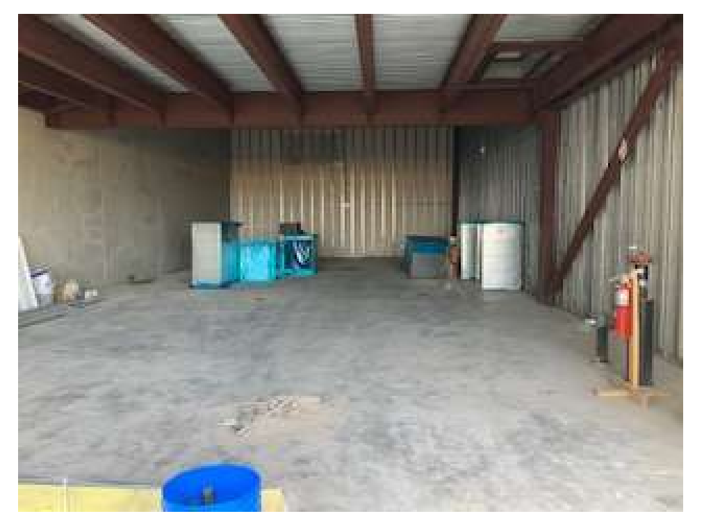
Ventilation going in